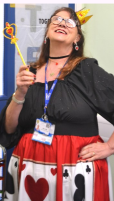
Queen of Hearts