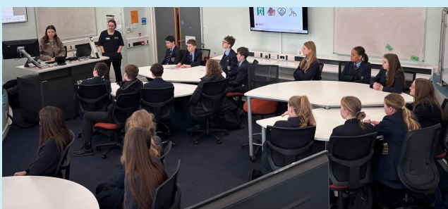
Inside a teaching room at the university.

PQA is a weekend performing arts Academy providing tuition for children and young people from 4-18 years. Students spend three hours with us, rotating through hour-long sessions in Comedy & Drama, Musical Theatre and Film & Television. Students are split into groups according to their age and are taught by specialist expert teachers.