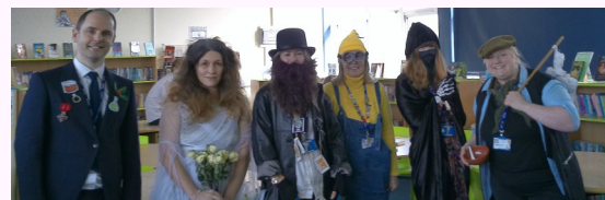
The English Department. Mr Birling, Miss Haversham, Fagin, a minion, The Ghost of Christmas Future and Oliver Twist.