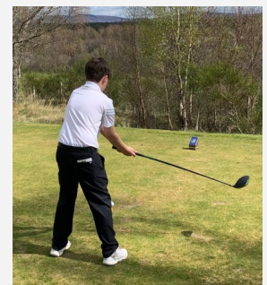
In action in Scotland