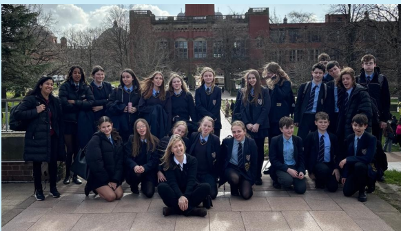
Year 9 students on Birmingham University campus.