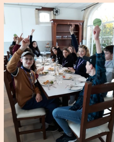
...those who tried frogs legs and were proud of it!