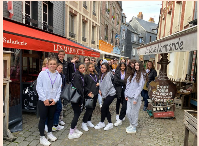
...just arriving in Honfleur