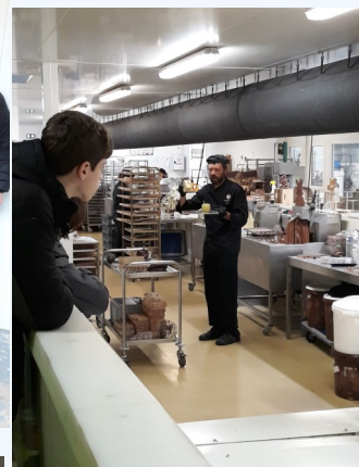
....at the Boulangerie