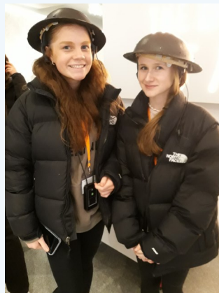
Wellington Quarry visiting the tunnels of Arras