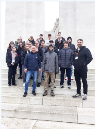
Canadian Memorial at Vimy Ridge