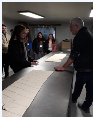
More about the French immersion visit in the next newsletter...